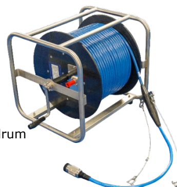
100 m Cable drum (641-0308)